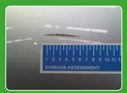
Scuff on surface not penetrating base material