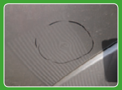
Dent on body