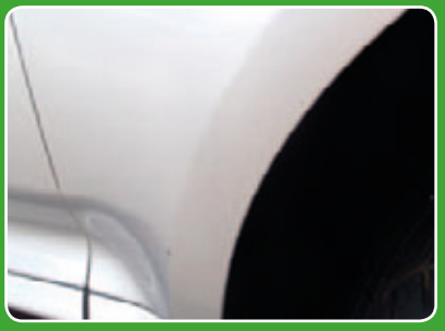
Small area of chipping